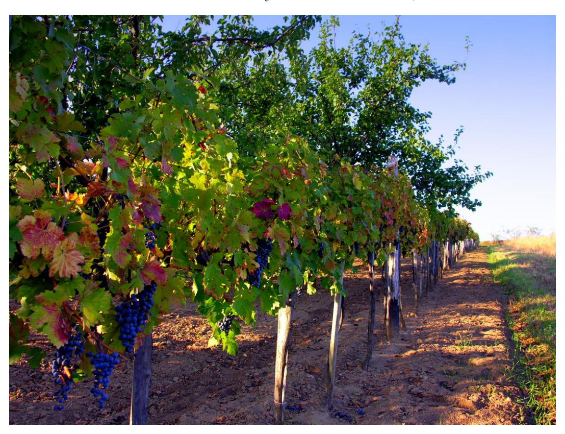
June 14, 2020 – Proper 6 The Second Sunday after Pentecost

Rooted in the Word, Nourished by the Sacraments, Alive in Jesus Christ